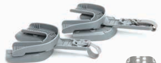
Advances at 1mm increments across full range of protrusion settings