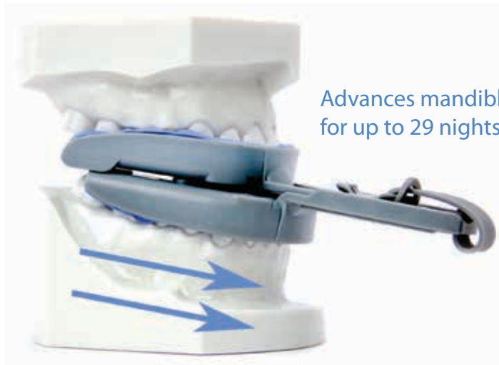
Advances mandible for up to 29 nights