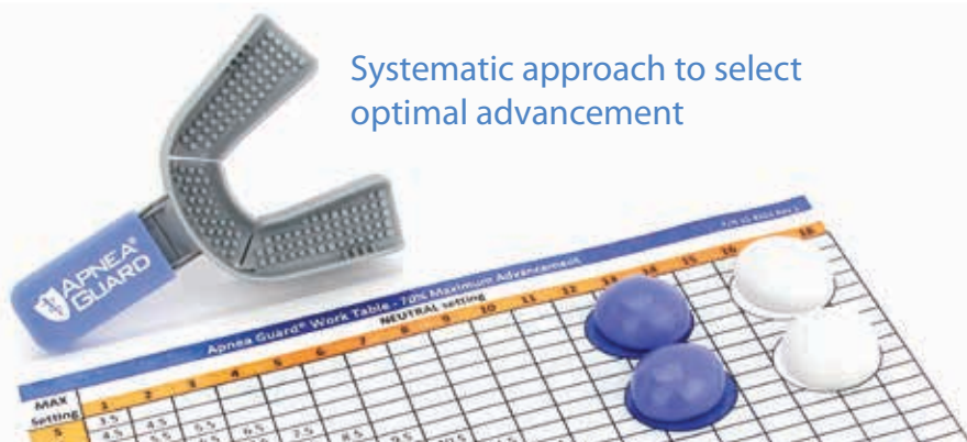
Systematic approach to select optimal advancement